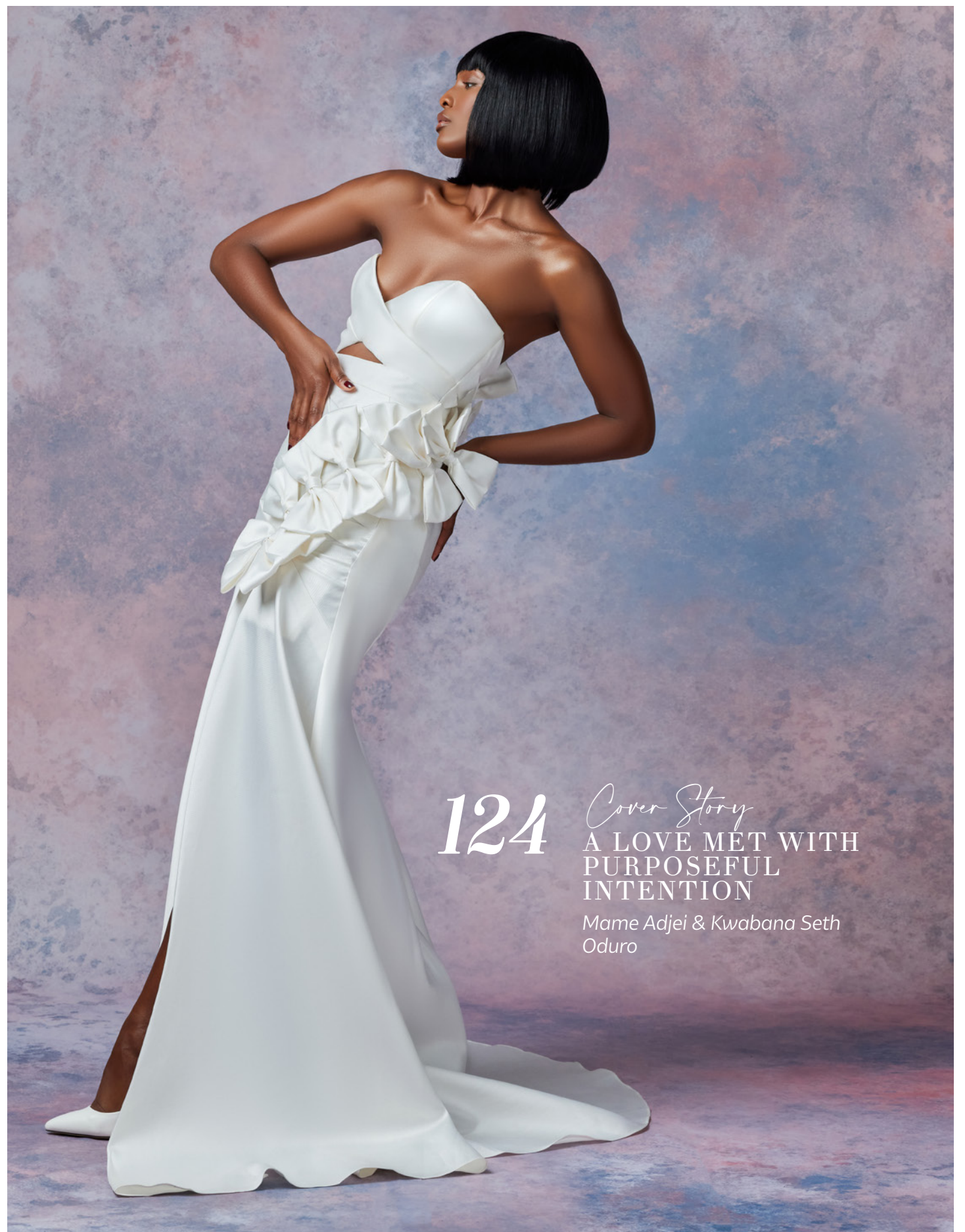
TABLE OF CONTENTS WINTER 2022